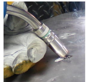
0.8mm Aluminum Hood