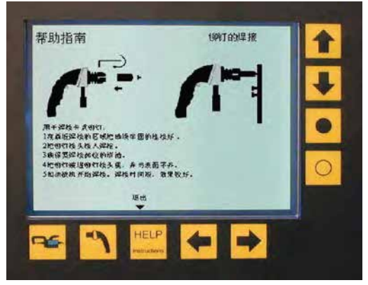
PR-2000 software is equipped with a multiple-language feature which allows the users to choose one of the several built-in languages.