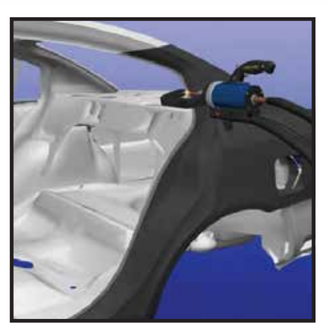
Spot welding of quarter panel using C-Arm (PS-302).