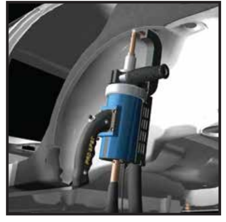
Wheel House welding with PS-52-5/8 Arm makes it possible to weld the most difficult applications.