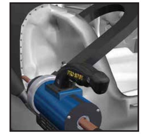
For deeper needs use the Pro Spot extension arms (PS-305 and PS-503-W). They are selfaligning and quick to install.