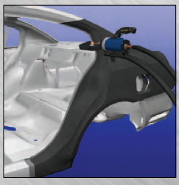
Spot welding of quarter panel using C-Arm (PS-302).