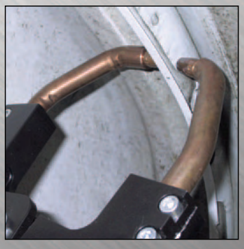
X-Adapter Arm is a must for tight areas with limited space for the electrodes.