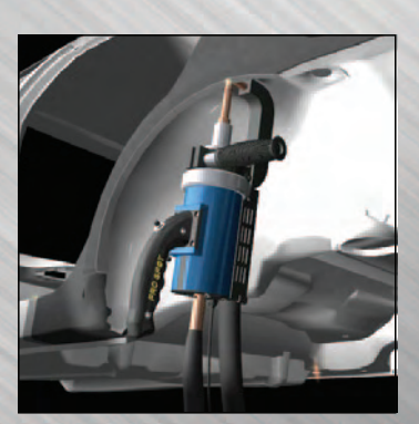
Wheel House welding with PS-52 Arm makes it possible to weld the most difficult applications.