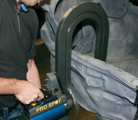
For deeper needs use the Pro Spot extension U-Arms (508mm - 600mm). They are self aligning and quick to install.