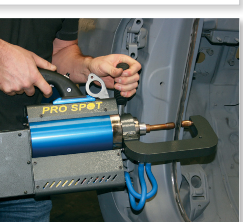
Spot welding of quarter panel using C-Arm