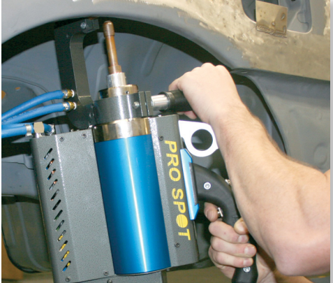
Welding with the Wheel House Arm makes it possible to weld in the most difficult areas.