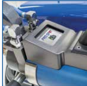
Display Screen On Gun