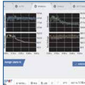
Export Logs For Immediate Feedback