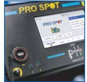
Audio & Video Playback