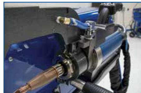
360° Arm Rotation