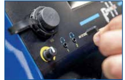
Built-in Headphone Jacks