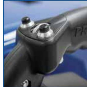
Scroll Wheel For Quick Program Control