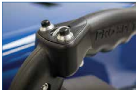
Finger Tip Controls