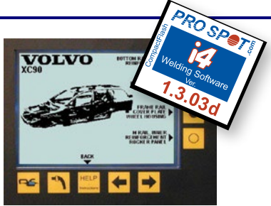
OEM Training on-board