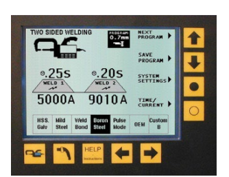
Boron Steel Welding