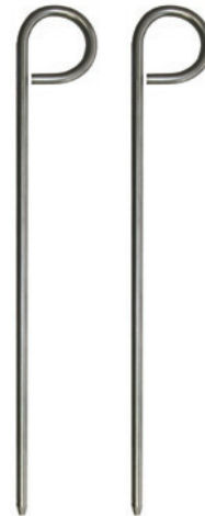
51-0059 Pulling Rod 2 ea.