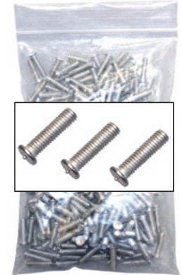
50-1320 M4 Studs 50 ea.