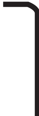
CLT-54 2 MM Allen Wrench 1 ea.