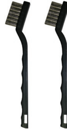
50-0580 Stainless Steel Brushes 2 ea.