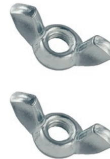
N-95 M4 Steel Wing Nut 2 ea.