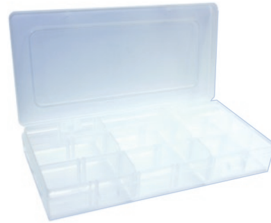
PS-1213 Plastic Box 1 pc.