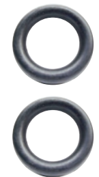
52-5501 Replacement Chuck Ring 2 ea.