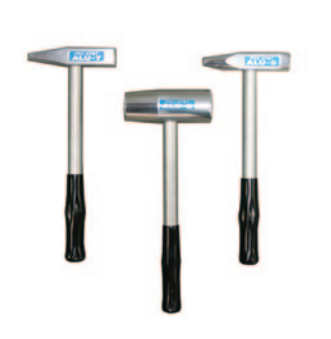
PRO-ALHMR 3 pc. Aluminum Hammer Set (optional)