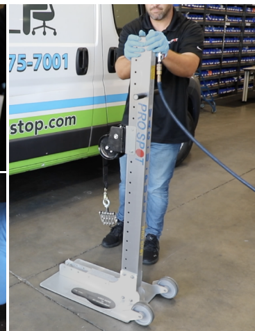
STRONG, SECURE & STABLE