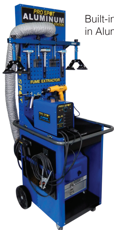
Built-in Fume Extractor Available in Aluminum Weld Station