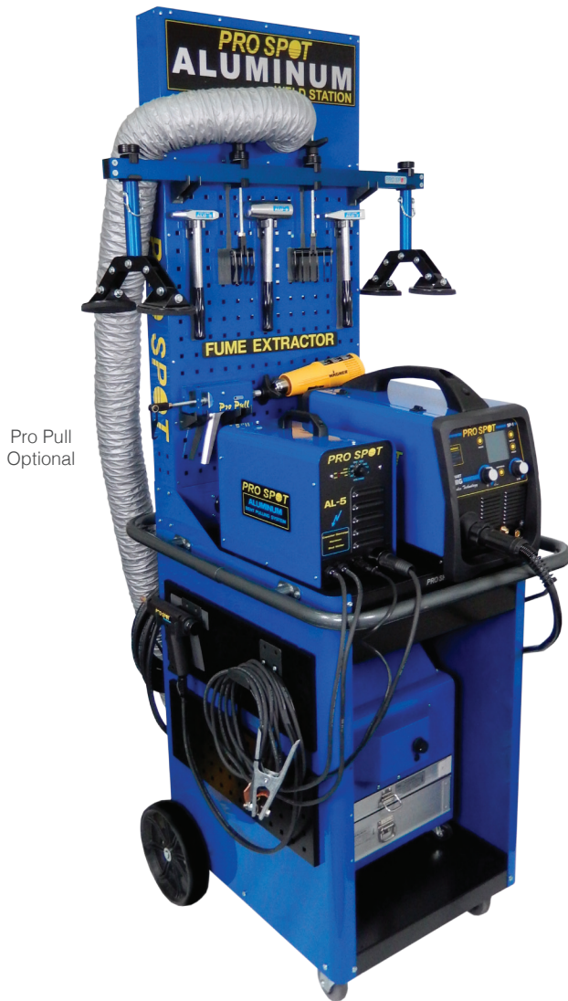
Pro Pull Optional