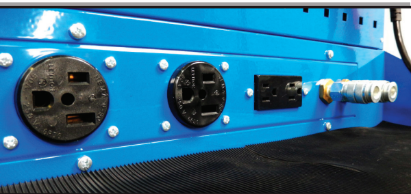
Utility Panel Includes (2) 220V Outlets, (2) 110V Outlets and (2) Air Outlets