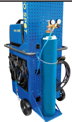
Gas Bottle Bracket