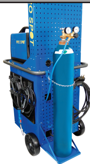
Gas Bottle Bracket