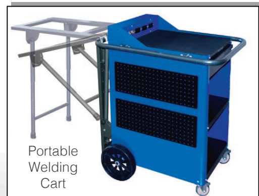
Portable Welding Cart