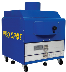
Built-in Fume Extractor