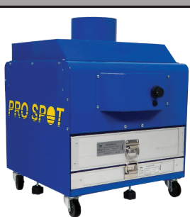
Built-in Fume Extractor

The built-in Fume Extractor is designed to extract all welding fumes from the work area.