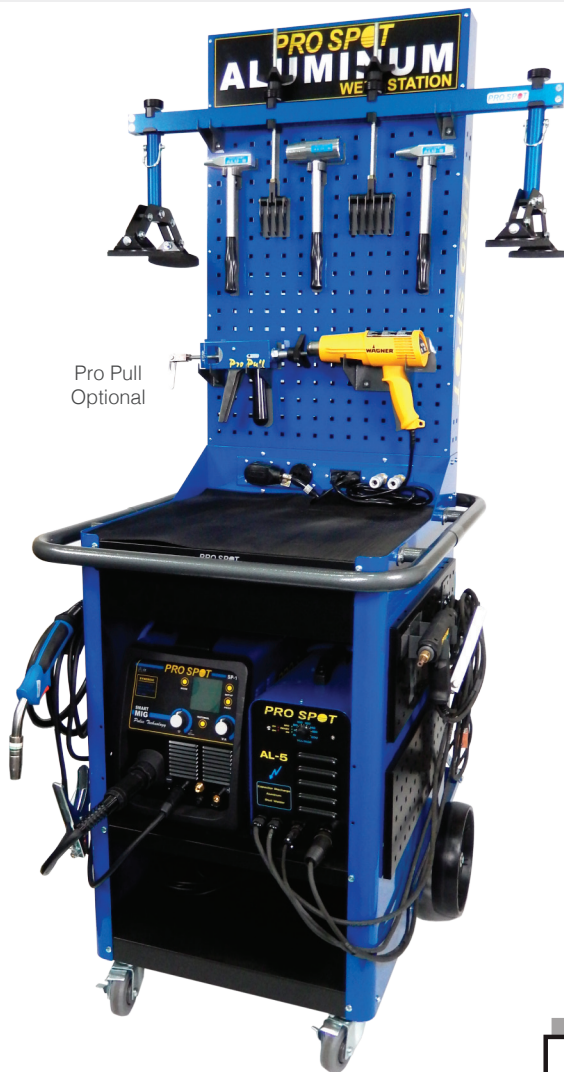
Pro Pull Optional