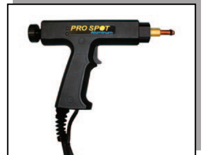
Stud gun with trigger