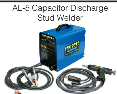
AL-5 Capacitor Discharge Stud Welder