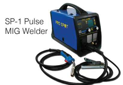
SP-1 Pulse MIG Welder