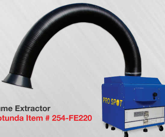
Fume Extractor Rotunda Item # 254-FE220