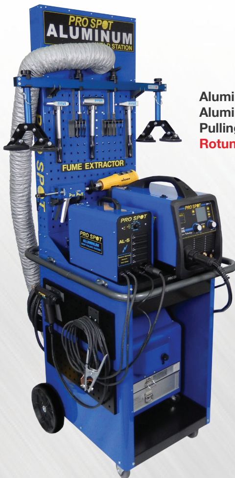
Aluminum Weld Station Aluminum Dent Pulling System Rotunda Item # 254-MWS-AL-K2