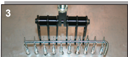
Aluminum Stud Dent Pulling