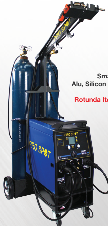
Smart Pulse MIG Alu, Silicon Bronze, Steel All-in-One Rotunda Item # 254-SP5