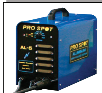
AL-5 Aluminum Stud Welder

The Aluminum Weld Station is designed to meet all of your aluminum repair needs. The station includes a portable welding cart, accessories for aluminum dent pulling, and the AL-5 Capacitor Discharge Stud Welder. The welding cart includes a tool board, utility panel (air outlets, 110V & 220V electrical outlets), a work surface covered with a high quality textured rubber mat, and a sliding drawer for storage. The AL-5 is designed for aluminum dent pulling and welding UHSS panels.