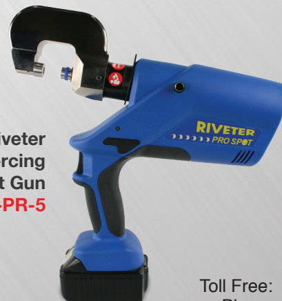
PR-5 Riveter Self-Piercing Rivet Gun Rotunda Item # 254-PR-5

Toll Free: 1 877 PRO SPOT Phone: +1 760-407-1414 Fax: +1 760-407-1421 E-Mail: info@prospot.com Web: www.prospot.com