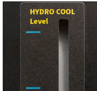
Water Coolant Level Indicator