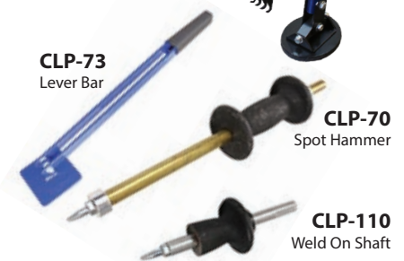
CLP-70 Spot Hammer