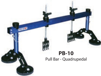
PB-10 Pull Bar - Quadrupedal