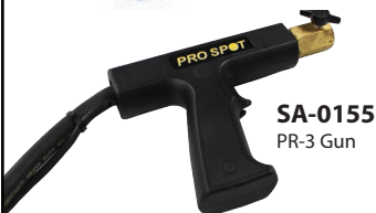
SA-0155 PR-3 Gun

Copyright 2017 Pro Spot International Inc. (Rev. B 8/3/17)