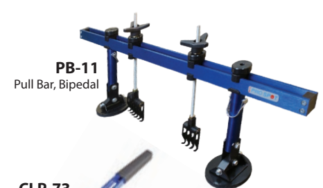
PB-11 Pull Bar, Bipedal