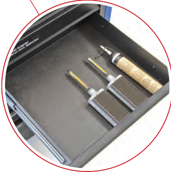
Accessory Drawers for Bonding Materials*, Adhesives*, Dispensing Guns*, etc.