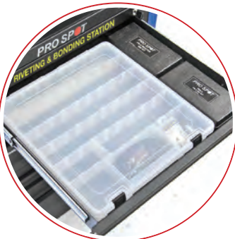
Die Kit and Rivet Organizer*

Foldable Table can be mounted on either side of station