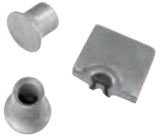
Self Piercing Rivet (SPR)