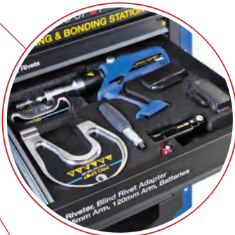
Secure Gun and Arm Storage