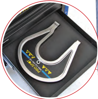
Capable to Store 240mm Arms*