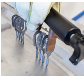
Save time with quick application of pull keys