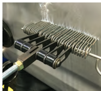
Tightly arrange keys for a more consistent pull