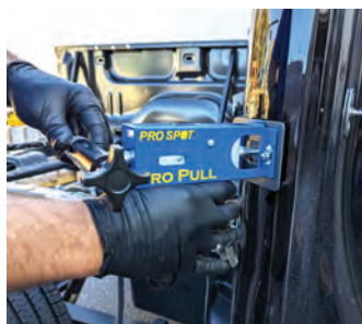
The PRO-65 provides targeted dent pulling