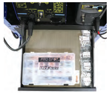
Drawers for convenient tools storage