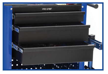
Built-in Three-Drawer Storage