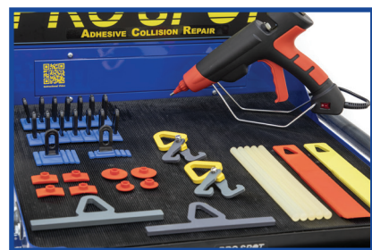
Textured Workspace for Job Staging