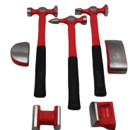
Steel Hammer & Dolly Set (85-1277)