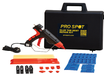
Glue Tab Dent Repair Kit (PRO-GTK)