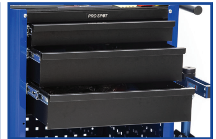
Built-in Three-Drawer Storage