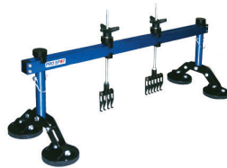
Pull Bar Dent Puller (PB-10)