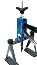
Pro Pull Dent Single Pull (PRO-66)