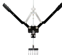
Advanced Pull Action Adapter (PB-20)