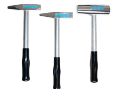
Aluminum Hammer Set (SA-0032)