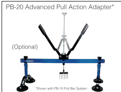
PB-20 Advanced Pull Action Adapter*