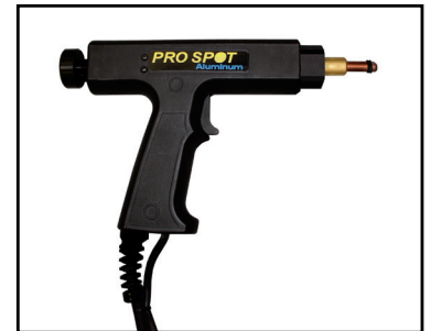
Stud gun with trigger