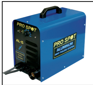
AL-5 Aluminum Stud Welder

The Aluminum Weld Station is designed to meet all of your aluminum repair needs. The station includes a portable welding cart, accessories for aluminum dent pulling, and the AL-5 Capacitor Discharge Stud Welder. The welding cart includes a tool board, utility panel (air outlets, 110V or 220V electrical outlets), a work surface covered with a high quality textured rubber mat, heavy duty adjustable shelves, and a sliding drawer for storage. The AL-5 is designed for aluminum dent pulling and welding UHSS panels.