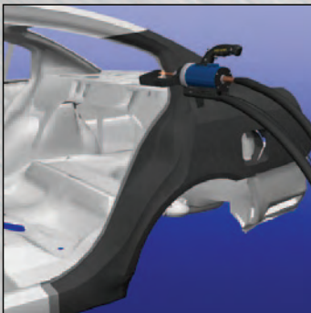
Spot welding of quarter panel using C-Arm (PS-302).