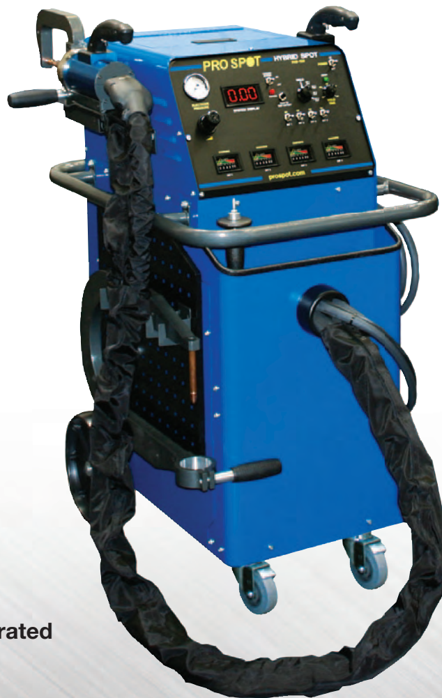
PHS-100 Hybrid Spot Welder

No 220V or 3-Phase required. Battery operated DC spot welding system.