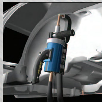
Wheel House welding with PS-52 Arm makes it possible to weld the most difficult applications.