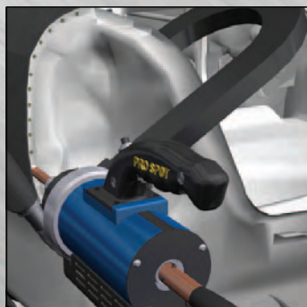
Consistent weld quality with short weld time.