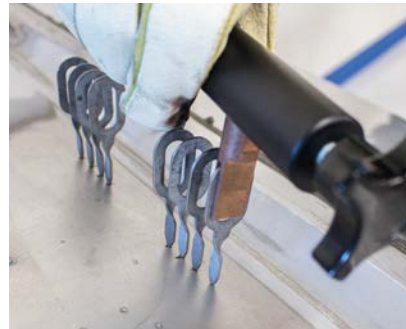
Save time with quick application of pull keys