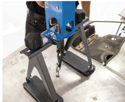
The PRO-65 provides targeted dent pulling