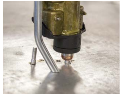
Apply keys and studs with Drawn Arc Welding