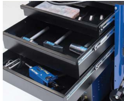
Dedicated drawers for steel and aluminum tool storage