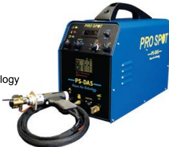
PS-DA5 Drawn Arc Technology (208 - 240V)