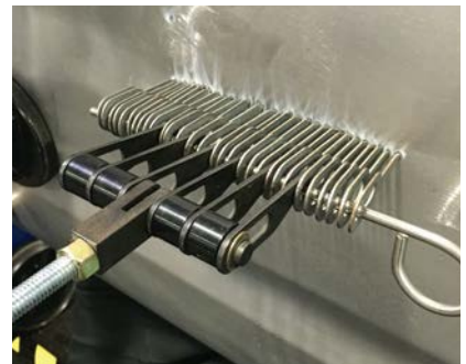
Tightly arrange keys for a more consistent pull