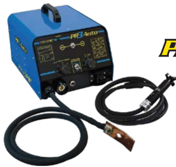
PR3 Auto PR-3 Auto (230V) or (400V)

Using the PR-3 Auto for fast, efficient steel dent repair and the PS-DA5's drawn arc technology for precise aluminum dent repair – you have a one-stop dent repair solution for your shop.